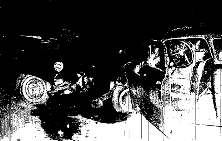
HEAD ON COLLISION - charges brought